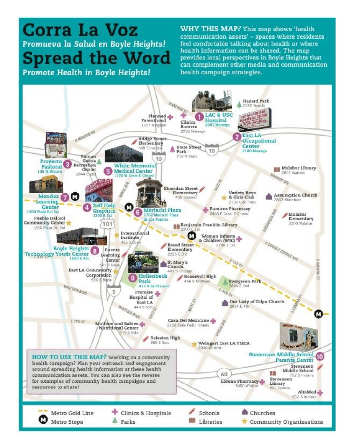
Figure 2. The front of the Boyle Heights communication asset map, mapped by the Promotoras.