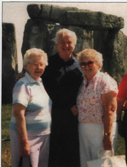
With two of his sisters in England.