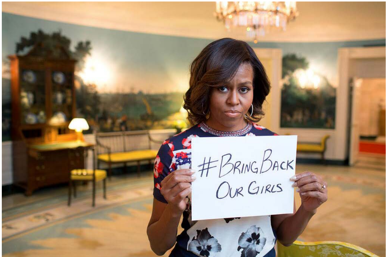
First Lady Michelle Obama making a plea for the return of the Chibok girls, 2014

“[We] need . . . to break down infidels, practitioners of democracy and constitutionalism, voodoo and those that are doing Western education in which they are practicing paganism,” he said. “All those with turbans [Muslim rulers] looking for opportunities to smear us, they are all infidels.”