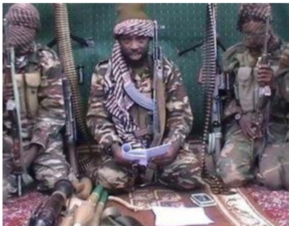
Abubakar Shekau (center) with other Boko Haram fighters