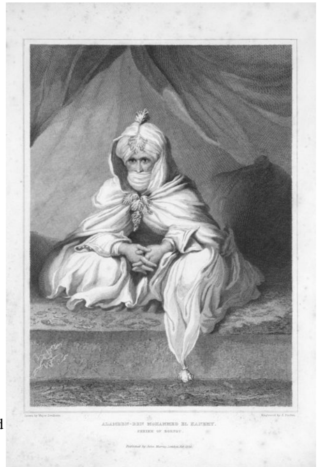
Muhammad Al Amin ibn Muhammad al-Kanami. 1826

In a case of imperial balance-of-power politics, Germany complicated matters by creating the West African colony known as Kamerun which included parts of contemporary eastern Nigeria. As a consequence, the British and Germans divided Borno between themselves. Dikwa became part of the German protectorate (1902-1916), and the British took control of the remnants of the empire of Borno. Dikwa then became part of British Colonial Nigeria in 1923, as one consequence of the First World War .