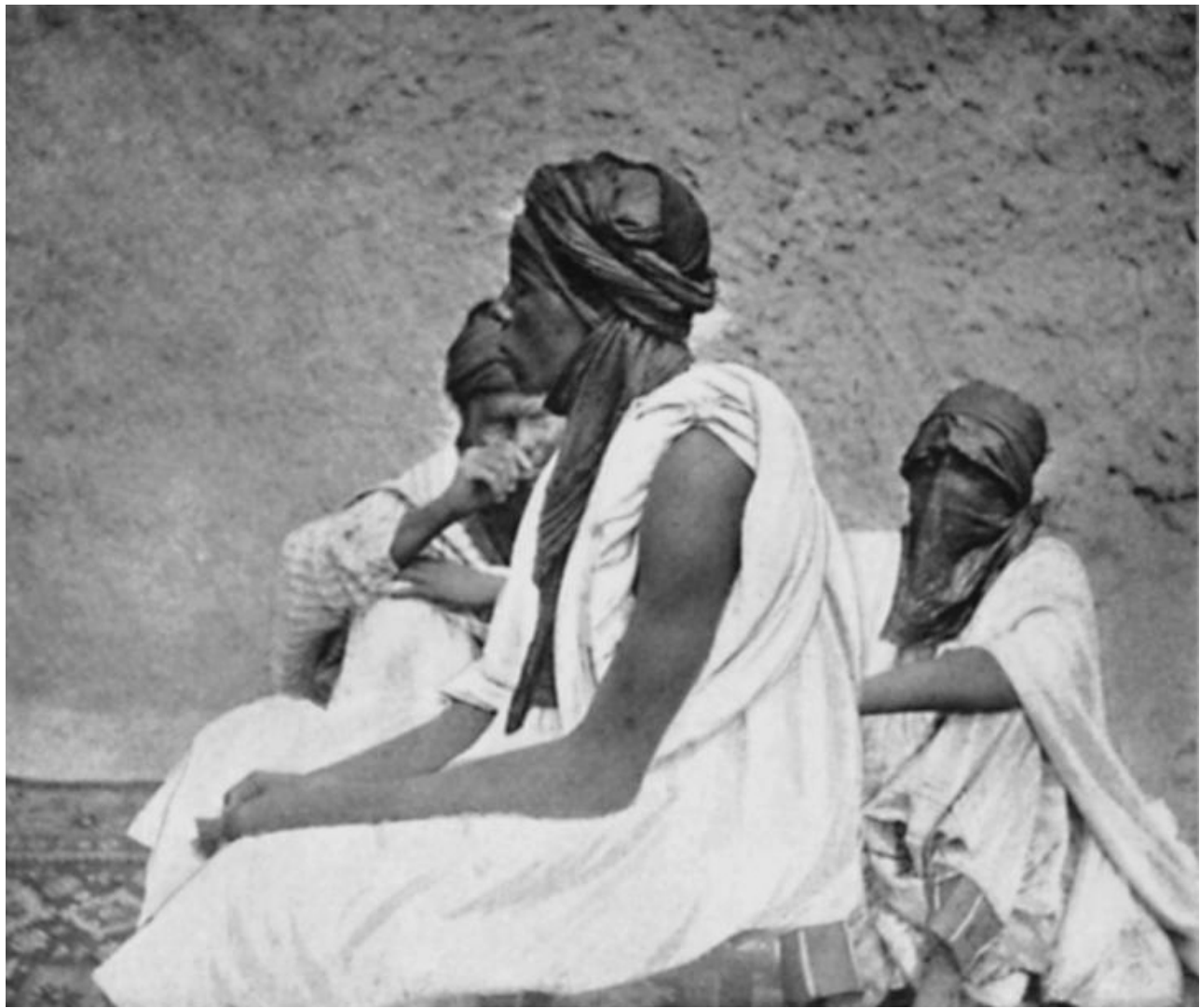
Members of Sokoto Caliphate, circa 1900

By contrast, they considered the Tijaniyya, Mahdiyya, and Sanusiyya Sufi orders to be fanatical and thus “bad Muslims.” The British believed that Islamic education would lead to fanaticism. And this conflict over education is the origin of the name “Boko Haram.”