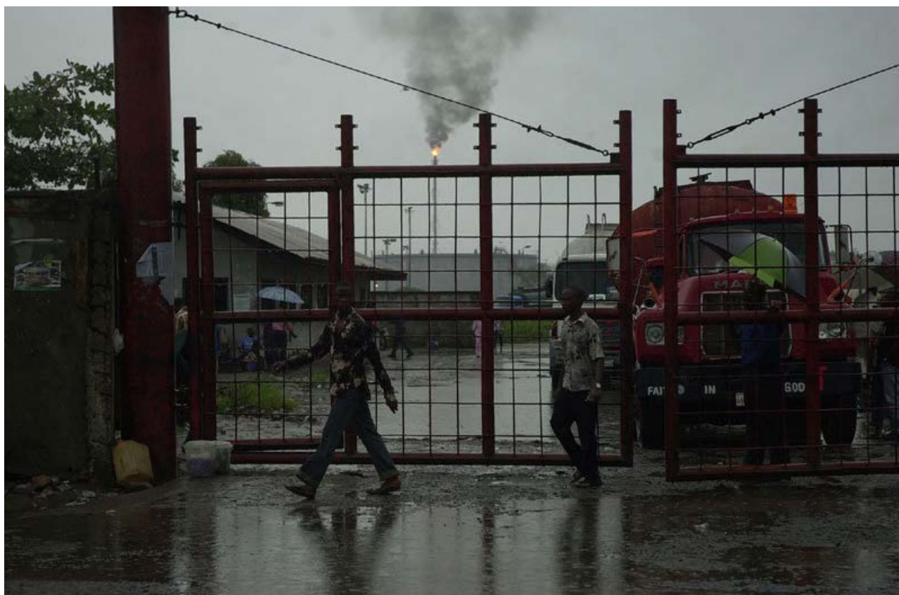
The workings of the oil industry in Port Harcourt, Nigeria

Boko Haram's origins are historically based, but economic resources, or the lack thereof, played a role in the formation and continuing existence of the organization. Nigeria is an oil-rich country mired in a great deal of political corruption. Hence, the majority of the population has not enjoyed any of the benefits afforded by this oil wealth. Those peoples living in Northern Nigeria are experiencing many economic privations because that region in particular is arid or semi-arid, and lacks many resources.