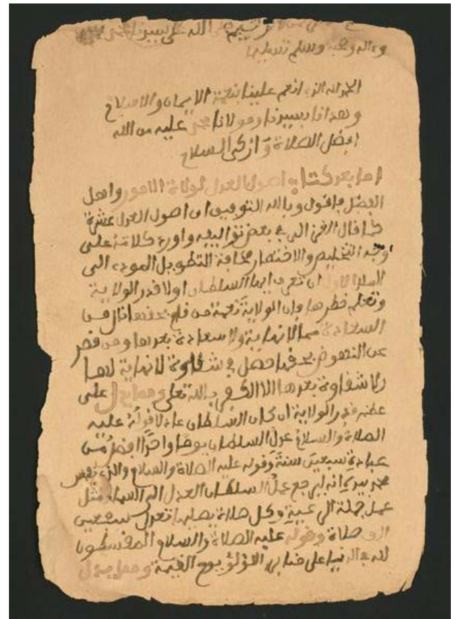
Records of the formation of the Sokoto Caliphate, circa

When Borno was conquered by Rabih Zubayr ibn Fadallah in 1893, he made Dikwa (54 miles east-northeast of Maiduri) his capital. In 1900, Rabih was killed by the French who then proceeded to restore the al-Kanami family to power in Dikwa. Then, in 1902, the British conquered Borno and incorporated it into its colonial possession known as the Northern Nigeria Protectorate.