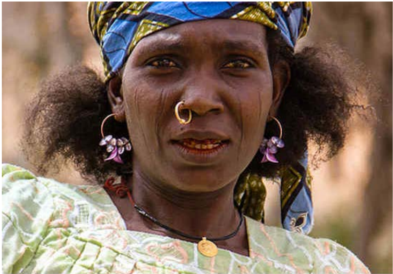
Typical Kanuri tribal marks

Today the Kanuri continue to be the dominant ethnic group of Borno state in northeastern Nigeria. Though that ethnic group only makes up about eight percent of Nigeria's total population, most of Boko Haram are Kanuri.