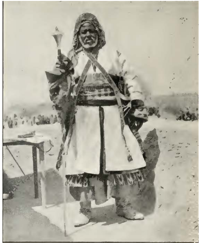
The Shehu of Bornu.

Bukar Garbai (or Abubakar Garbai) ibn Ibrahim, was the Shehu of Borno from 1902-1922