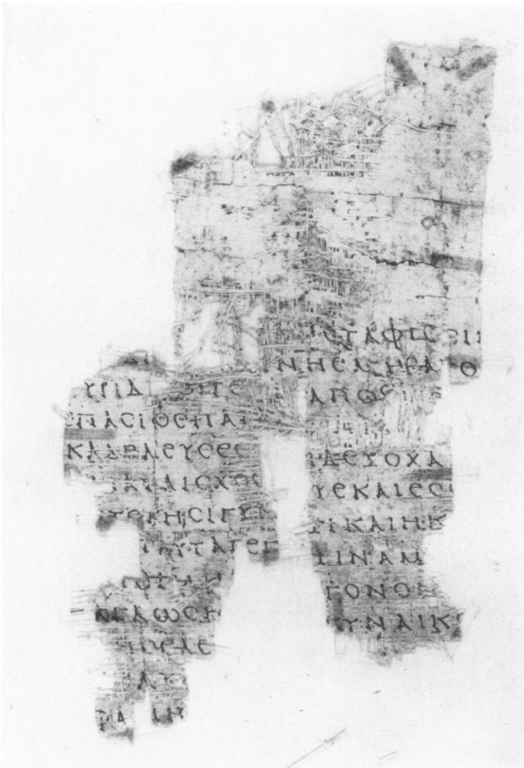
(P. Teb. 431 descr.)— Odyssey XI, 428–440.