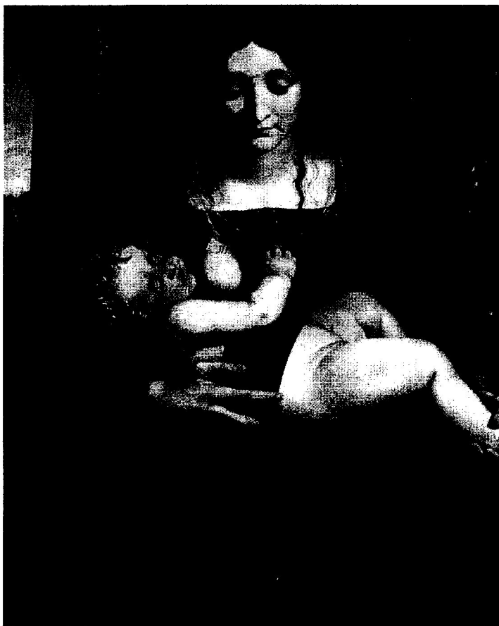
“The Virgin and Child,” by Giovanni Antonio Boltraffio (1467-1516), as it appears on the jacket cover of Slavoj Žižek’s “The Puppet and the Dwarf.”