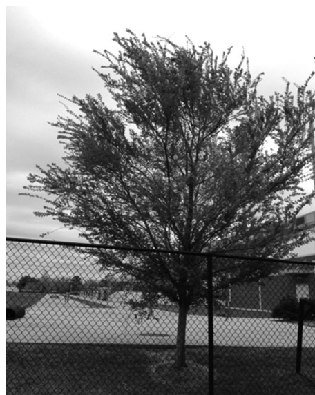
FIGURE 1. Photograph Portfolio of the American Dream by Drew

changed. Through thematic analysis, we coded students' understandings of the American Dream vis-à-vis the American Reality (Riessman 53). Major themes included effort, resistance, inequity, social structure, and perspective change. Conventional understandings of freedom, social promotion, and opportunity were predominant in students' representation of the American Dream. Students confirmed that not all people have the same resources or starting points, but they stayed firm in their beliefs that "hard work" is sufficient to overcome such barriers. Yet, at least a third of the students shared that their ideas about the American Reality changed—that hard work alone does not guarantee success. We analyzed samples of student work to contrast perspectives about effort, accessibility, and equity from opposite ends of the spectrum; analysis revealed how students challenged conventional understandings of the American Dream.