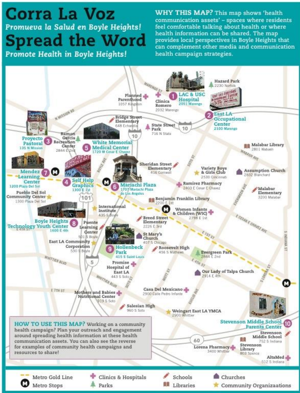
Figure 2. The front of the Boyle Heights communication asset map, mapped by the Promotoras.