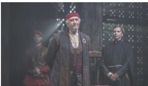
Shakespeare's Globe – The Merchant