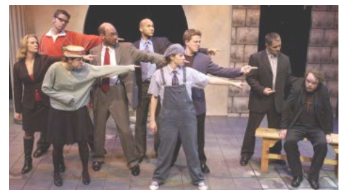
Steppenwolf's LookOut and Second