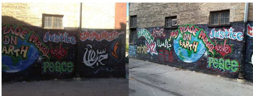
Figure 1. Community Walk