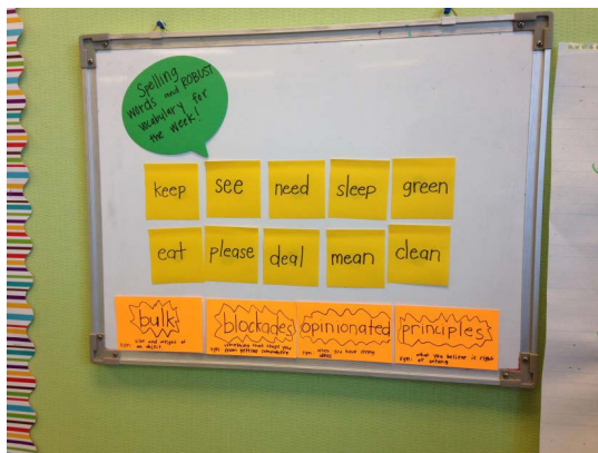
Figure 2. Word Wall in Lisa's Classroom

Building connections (Gee, 2005) between the D/discourse of word walls and assessments, Lisa utilized her realization to inform individualized assessments with Maria. After collecting data through a FoK interview and community walk, Lisa recognized how the word-wall term "bulk" in the context of grocery shopping, presented a challenge for Maria who "rarely goes grocery shopping" (FoK assessment October, 2013). Negotiating the deficit-based Discourse model, Lisa connected the role of ELs' FoK and Discourses in language learning with the assessment of academic vocabulary, realizing that it is "crucial to understand FoK so activities and assessments can be linguistically appropriate and yield authentic assessments" (Case study, p. 4). As such, Lisa built awareness of the need for culturally valid assessments drawing on students' FoK; however, she struggled with the practicality of finding time to assess individual students within rigid daily schedules. She reflected, "The rigor of the daily schedule puts a lot of pressure on the teacher...but it is all within the teacher's realm of power to administer FoK interviews" (Case study, p. 5). Lisa's field experience mediated her recognition of the value of FoK in authentic instruction and assessment and her agency to create time for FoK.