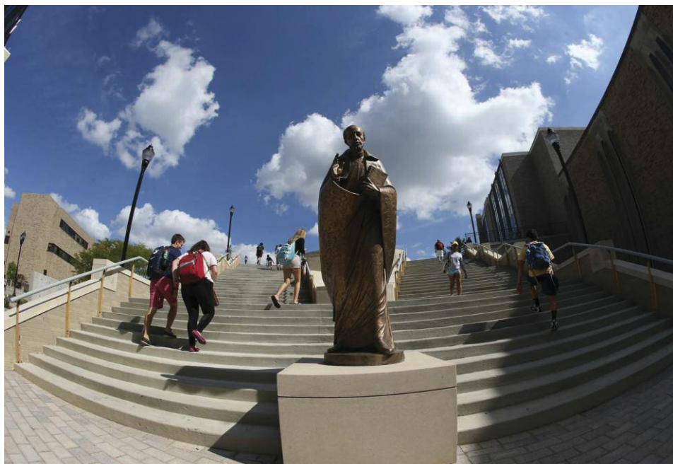
A statue of Saint Ignatius outside Alter Hall, Xavier University.

The Ignatian tradition engages Jesus precisely as incarnated dialogue, precisely as the very expression of divine speech. Jesus is the eternal Word who engenders mutuality and authenticity, the Imago Dei in which we are all made. This incarnational sense is what stands between binaries, digital or otherwise, and holds them together. The living Word calls us to constant account for our words and invites us to practice a comprehensive relationality in all of our encounters. While other traditions might encourage the idea of Jesus as worthy of emulation (specifically as an idea out there ), the Catholic/Jesuit tradition sees Jesus as physically inscribed in all persons and things. It sees in Jesus, as the poet Denise Levertov gleaned,