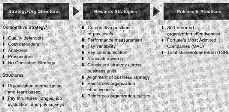
FIGURE 1 Reward Alignment Model