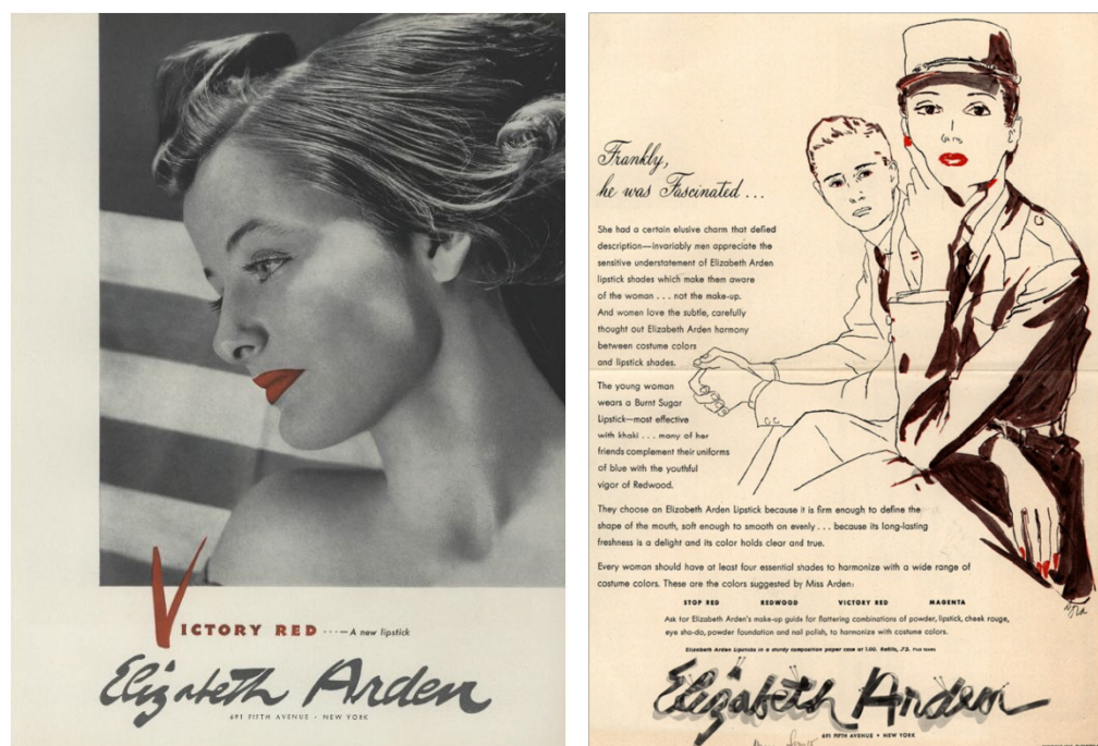
Figure 1. Elizabeth Arden advertisements (1941-1942) for patriotic Victory Red lipstick.

Sources: HPrints; Duke University Libraries Ad*Access