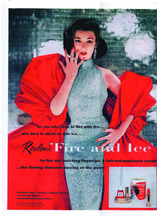
Figure 2. Revlon's (1952) 'Fire and Ice' advertisement.