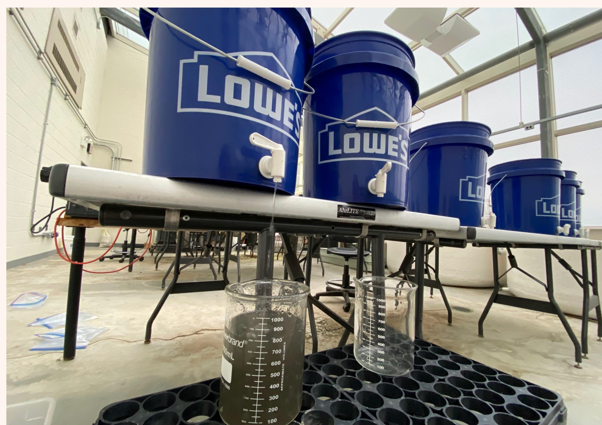
Photo 1. Experimental set-up of saline solution (6,000mg Cl - /L) flowing through matrix of 50% Biochar / 50% Sand or 100% sand.