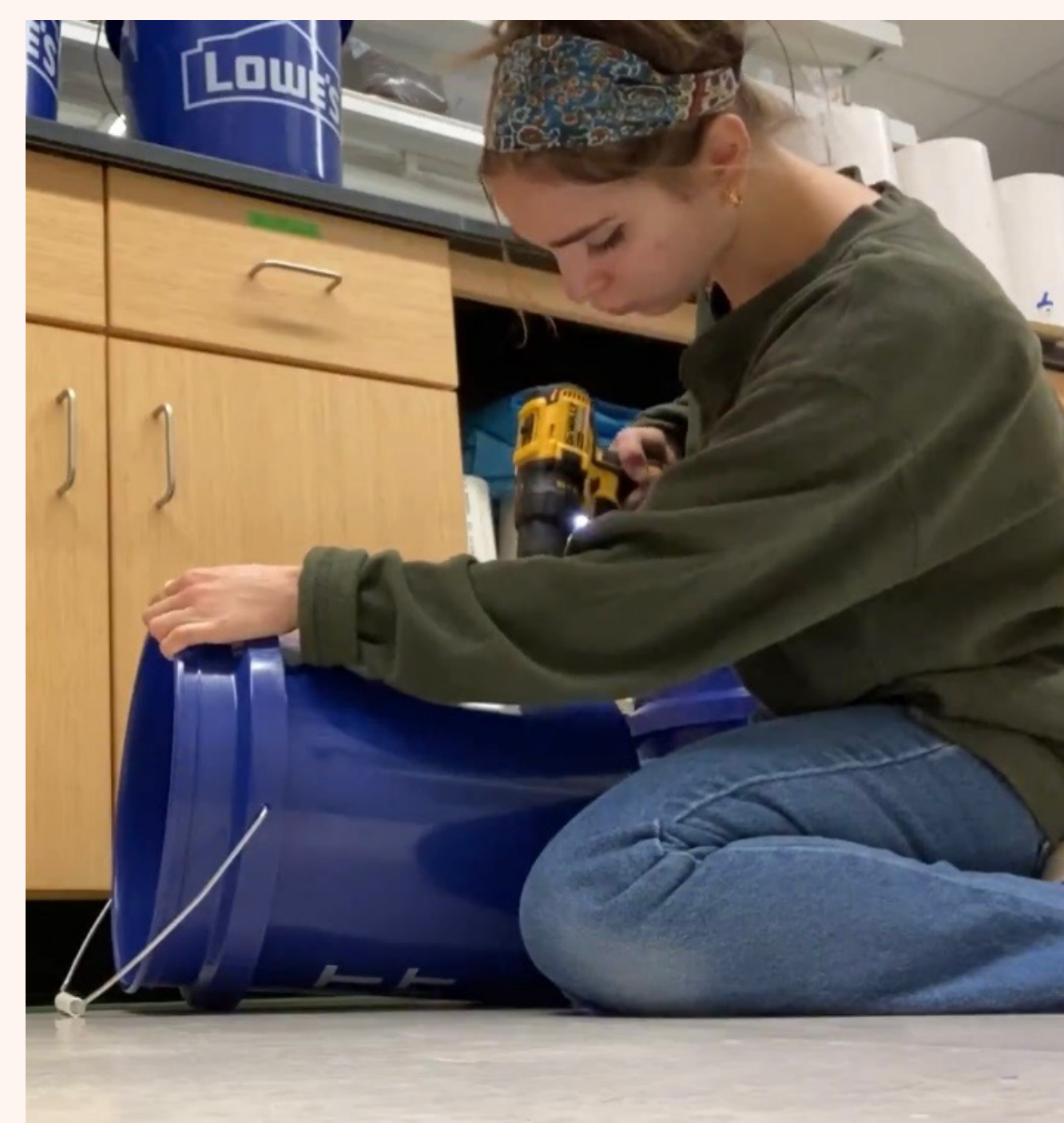
Photo 2. Constructing a flow-through system with buckets and spigots.