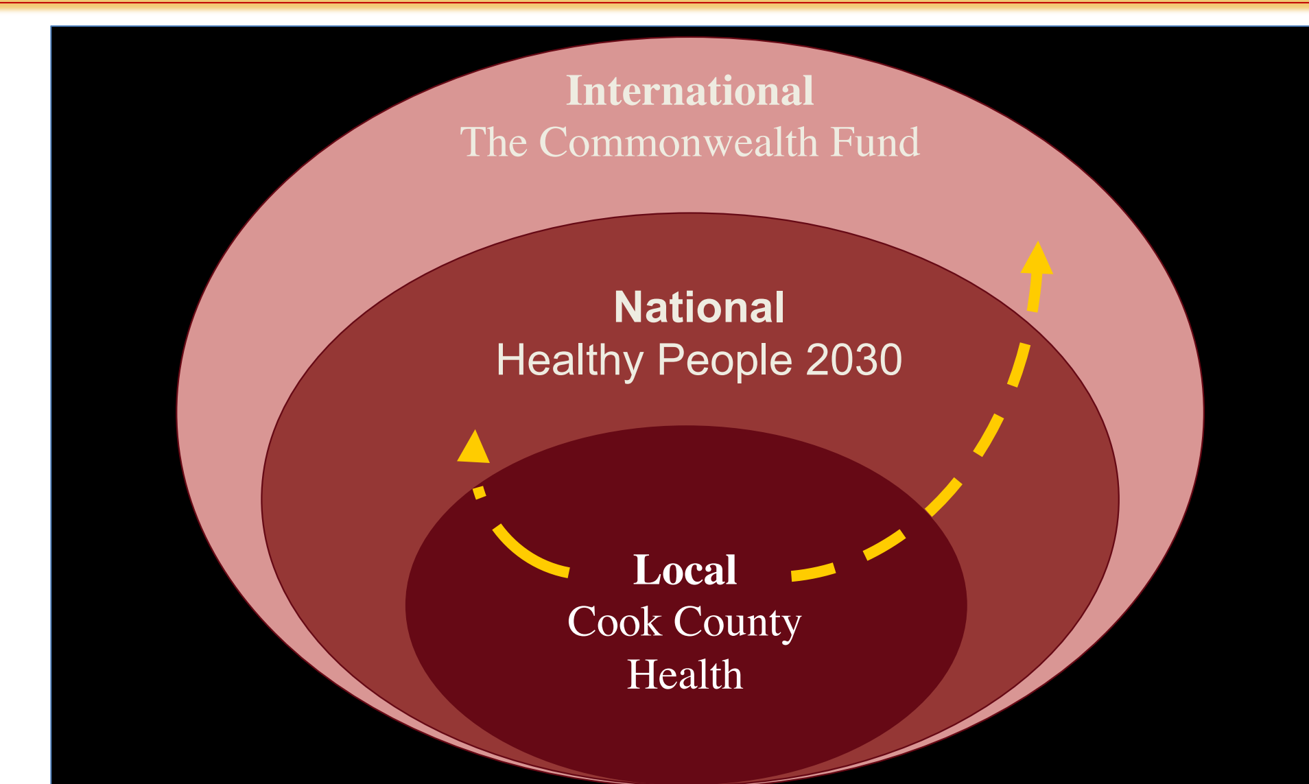
1.2 Socioecological model demonstrating the correlation between the local health objective, national health standards, and international health standards.

This figure represents the inconsistent correlation between CCHHS objectives and HP 2030 standards. Decreased correlation from HP 2030 between CCHHS objectives and The Commonwealth Fund standards is observed.