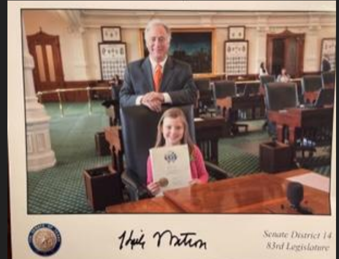
Paging at the Texas Senate at 10